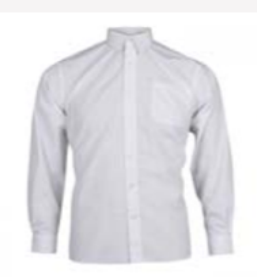
White long sleeved or short sleeved shirt