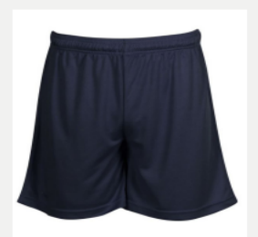
Navy blue shorts