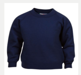
Navy blue sweatshirt