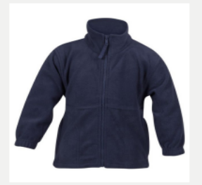
Navy blue fleece jacket (optional)