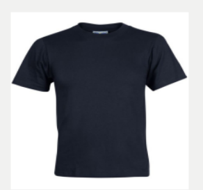
Navy blue t-shirt

Current students in year 8 to 10 may continue to wear existing uniform until it is worn out or grown out of.