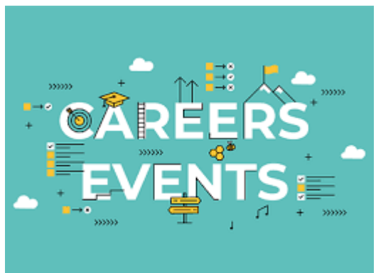
Careers Activities for Next Term